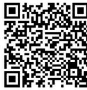
For online registration

For detailed questions or registration, please contact us at inquiries@mysteel.com .